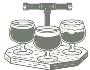
ESPRESSO MARTINI FLIGHT

Chocolate Raspberry, Orange, Pistachio, Butter Pecan 38